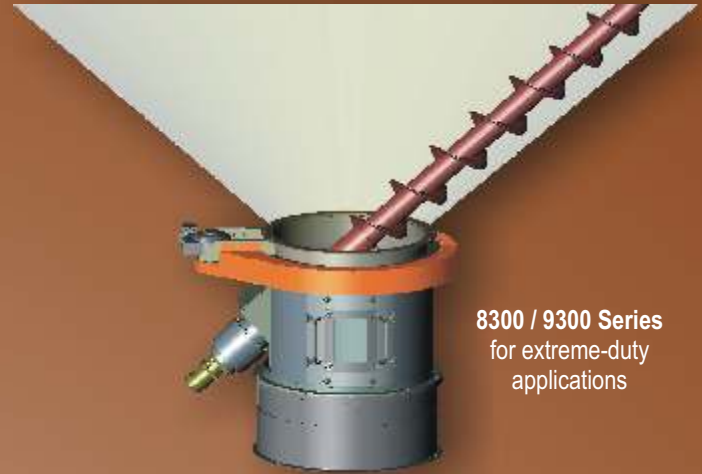
8300 / 9300 Series for extreme-duty applications