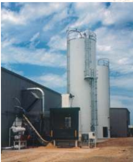
Composite Board Facility

Ideal for grain meals, meat meals, wood products, plastics, pellets, wheat midds, sugar, and other products with marginal flow characteristics.