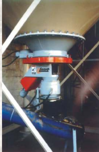
Meat Rendering Facility