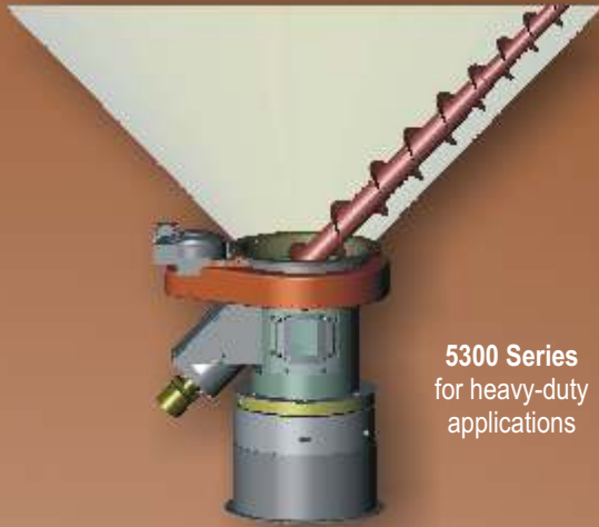
5300 Series for heavy-duty applications